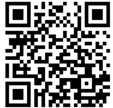
Exam application form

Any Enquiry, welcome to call 36053322, indicate you are apply for IVE Revit Certified User Exam.